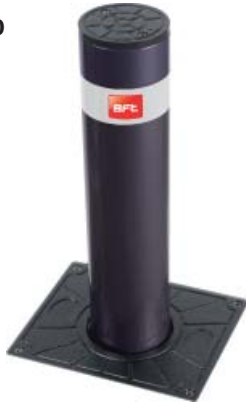
STOPPY B 115/500