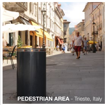
PEDESTRIAN AREA - Trieste, Italy