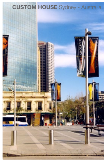
CUSTOM HOUSE Sydney - Australia