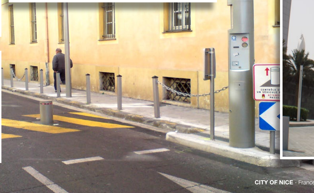
CITY OF NICE - France