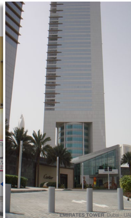
EMIRATES TOWER Dubai - UAE