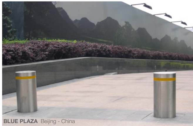
BLUE PLAZA Beijing - China